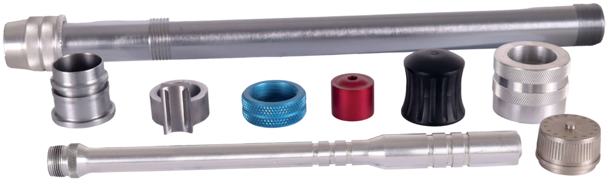
MAGAZINE TUBE AND MAGAZINE SHAFT, NUT MODELS