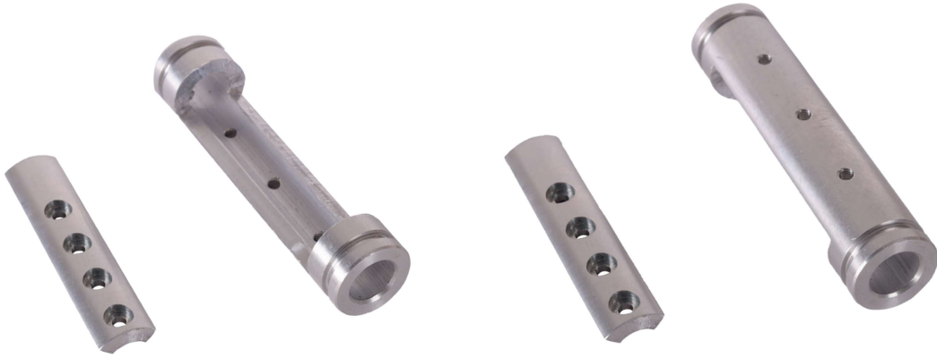
DRAIN TRANSFER NUT