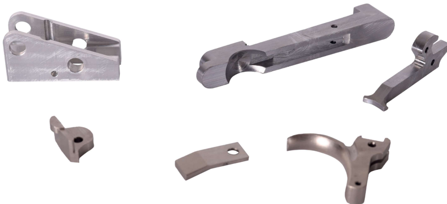
FOREND LOCK, TRIGGER, SIDE HAIR STYLES